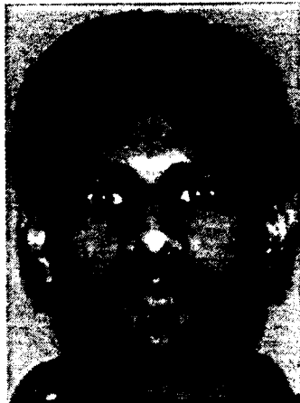
Nawaf Mohamed Salem ALHAZMI

American Airlines #77 Dulles Intl to Los Angeles Pentagon